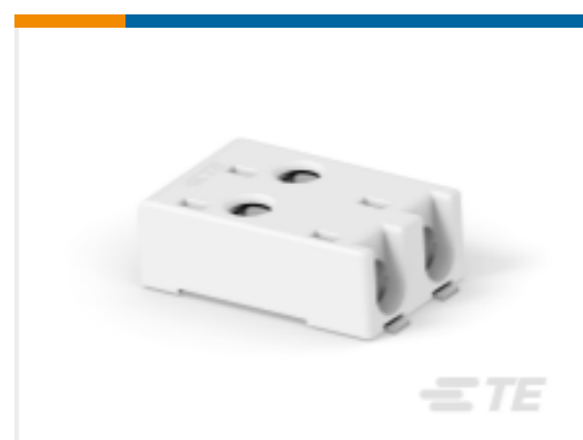
TE Part # 2834385-2 RELEASE POKE-IN CONNECTOR_2P_NATURAL